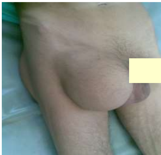
Fig 1 : Huge right femoral hernia

Digital rectal examination was normal. The left groin was normal. Diagnosis of very big right femoral hernia was ascertained on the basis of history and physical examination (Fig.1)