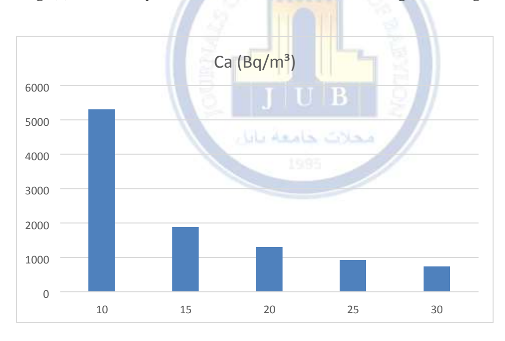
Fig. (3) The concentrations of <sup>222</sup>Rn inside the tube according to the height of chambers.