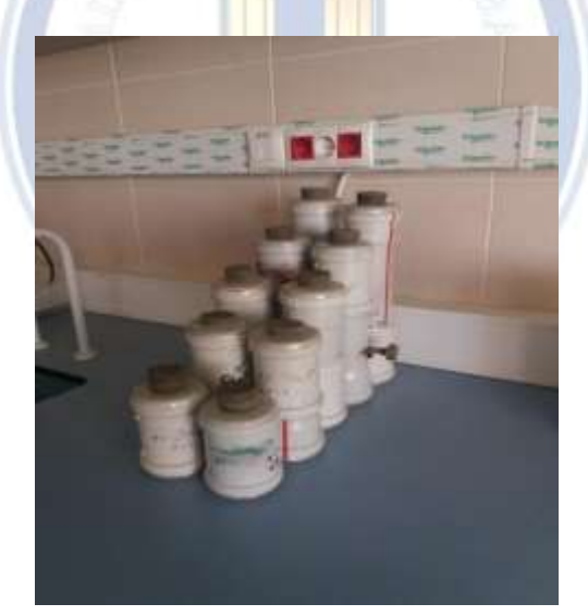
Fig. (1) Tubes at different height with their backgrounds.

The study of efficiency of CR-39 detector dependence on the chamber height, therefore, different height of the chambers was used in this study like (10, 15, 20, 25 and 30) cm, as shown in Fig. (1)